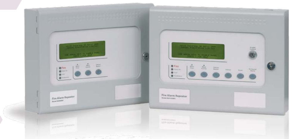
Focus Model No. K69000M1