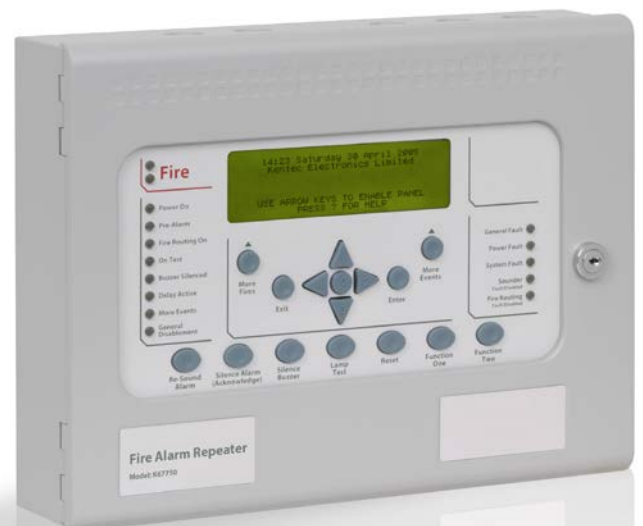
Model No. K67750M1